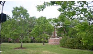
Red Oaks Planted at SMU Daycare Facility