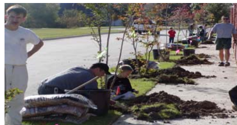
Homeowners Team Up to Complete a Parkway Tree Planting

Are you prepared for a busy fall planting season ahead? We are!!! Currently, our inventory of trees includes all of the species listed in the left column plus a few others that we normally don't grow. Right now, the Texas Trees Foundation has available a limited quantity of Japanese Maple, Deciduous Magnolia, Nellie R. Stevens Holly, Needlepoint Holly and a few others. The container sizes vary, so call our office to get more details on size and pricing.